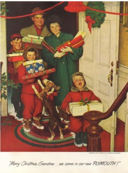
Caption reads: "Merry Christmas Grandma We came in our new Plymouth!"