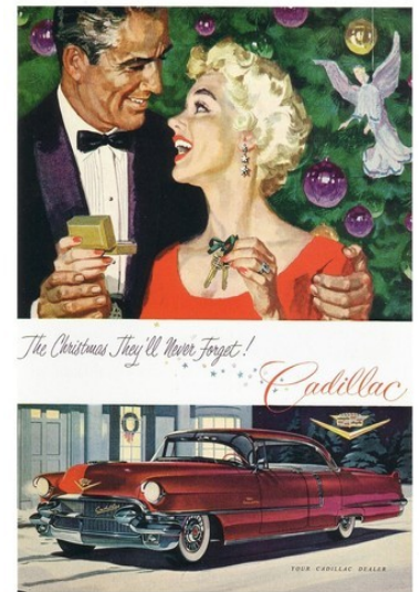
The always classy Cadillac ad from 1955.

On the back page we have the 16" 1967 motorized Ford Mustang fastback model from December of 1966. The car is in Brittany Blue and it ran forward and backward with adjustable front wheels. The model came fully assembled (Thank God!) with a "customizing" kit of GT stripes, racing stripes, personalized initials, rear view mirror and radio antenna. The cost of the model was $5.95 and available from your local Ford dealer.