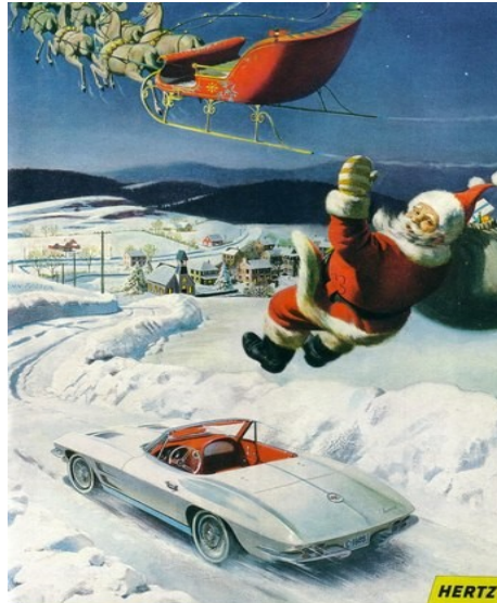
Hertz featuring a mid-1960's Corvette